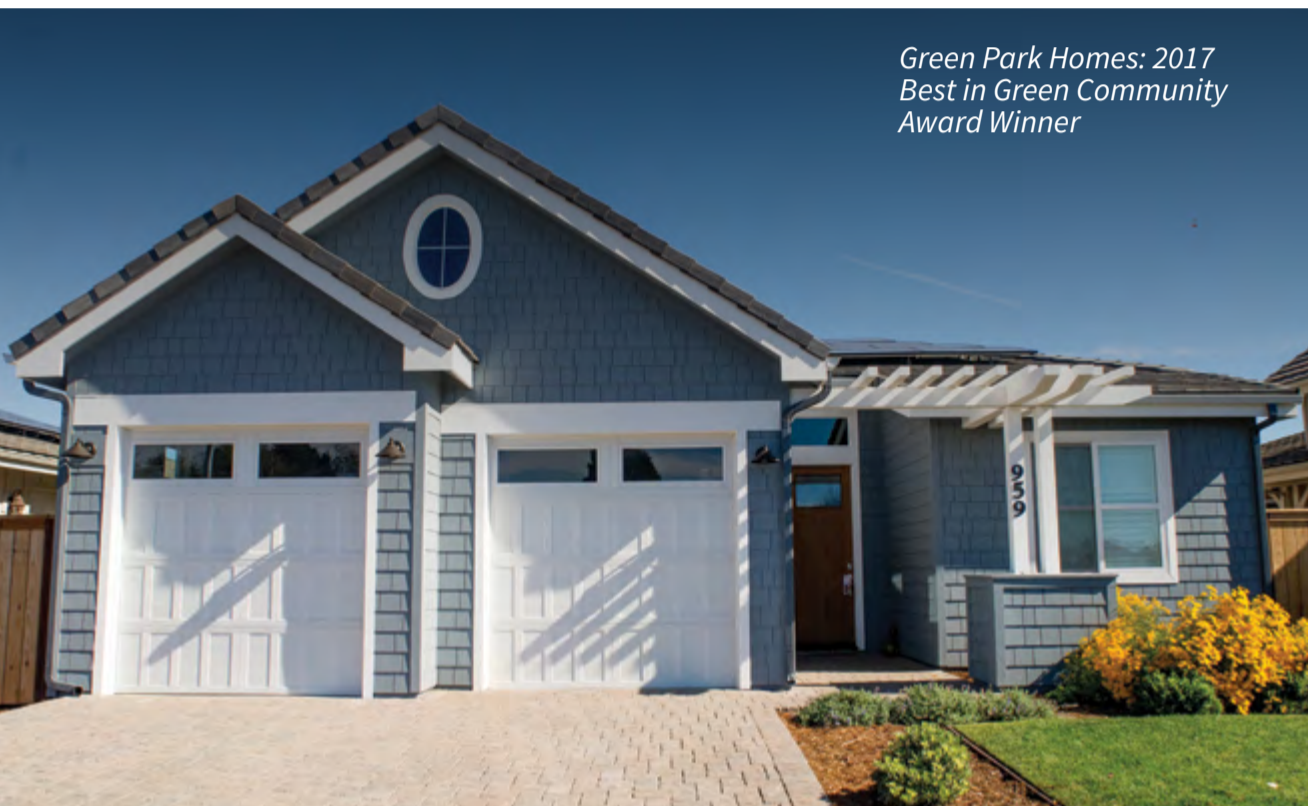
Green Park Homes: 2017 Best in Green Community Award Winner