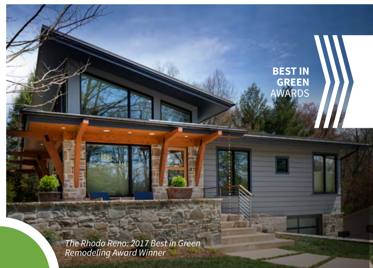
The Rhodo Reno: 2017 Best in Green Remodeling Award Winner

Sustainability and high-performance building can lower total ownership costs through utility savings and increased durability as well as improve indoor living environment. Voluntary, non-prescriptive green programs give builders and consumers the flexibility that they need to construct homes that are sustainable, cost-effective and appropriate for the home's geographic location.