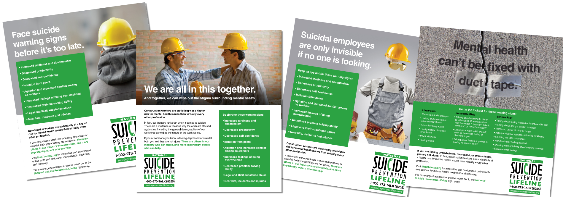
Click images to download flyers designed by the JP Griffin Group

“Realizing that THE BEST COMMUNICATION REQUIRES LISTENING. The company culture must BE OPEN TO ‘HEAR’ WHAT EMPLOYEES ARE SAYING and PROVIDE RESOURCES that can get them in a better mental state.”